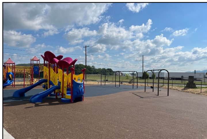
The recently completed playground

One instance of the public's feedback coming to life will be transformed this summer at Hoberman Park when extensive construction occurs. While a new skatepark was already installed last fall to kick off the construction project, more improvements are slated for this summer and fall. Amenities like a basketball court, multipurpose court, pavilions, walking path, restroom, ball fields, community garden and more will give new life to Hoberman