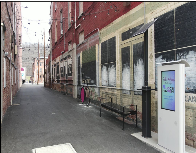
The recently renovated Fallon Alley, a project that dramatically improved a heavily trafficked alley in the downtown. The alley is used for outdoor dining and includes a kiosk with a merchant directory and a solar charging station for cell phones.

Downtown Lock Haven, Inc. is a non-profit organization focused on bettering the downtown district through events, merchant support, grant programs, and more. Among many other