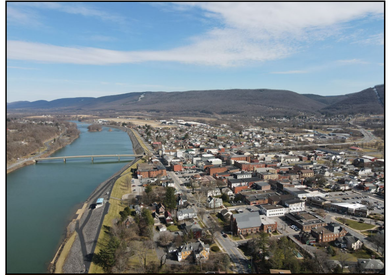
A photo of Lock Haven

The Lock Haven Summer Concert Series is celebrating its 26th year in 2024. These concerts offer free entertainment for residents and visitors to the area, and the Susquehanna River offers a perfect backdrop to the Floating Stage at the J. Doyle Corman Amphitheater. This year the concerts will take place on Friday and Sunday evenings, with Friday night concerts taking place in Triangle Park, and on Main Street in Downtown Lock Haven. The Sunday evening concerts are held at the amphitheater, and feature bands from all over the country.